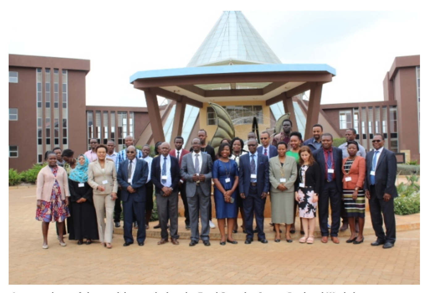
A group photo of the participants during the Food Security Centre Regional Workshop

The Wangari Maathai Institute for Peace and Environmental Studies (WMI) was honoured to co-host the Food Security Centre Regional Workshop. The event was organized by the University of Nairobi team in collaboration with the Food Security Centre and a consortium of local and regional Universities.