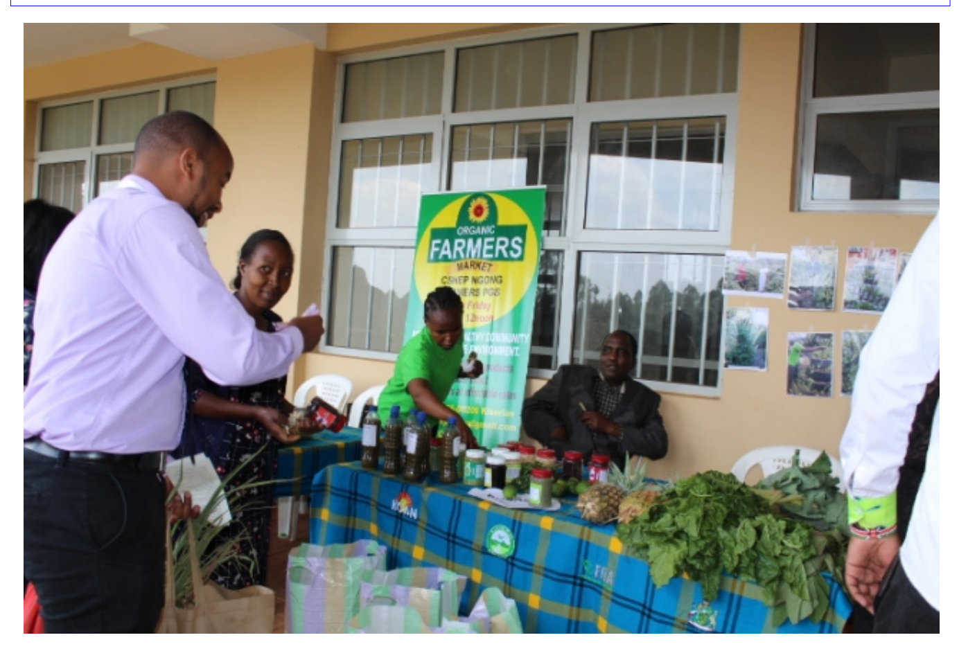
Organic Farmers exhibiting their organic produce

Wangari Maathai Institute for Peace and Environmental Studies (WMI), University of Nairobi was privileged to co-host the 2<sup>nd</sup> Kenya Organic Food Festival and Exhibition (KOFFE).